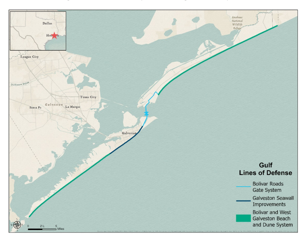
Figure 4. Gulf Lines of Defense of the Galveston Bay Storm Surge Barrier System